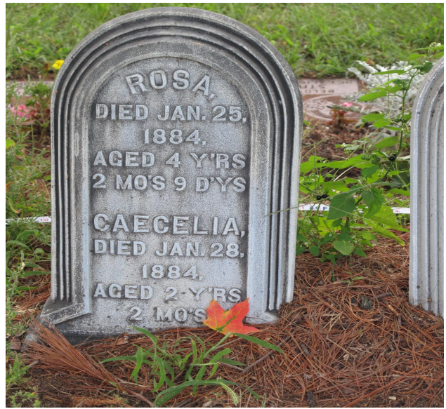
Rumpf Rosa age 4,Caecelia age 2