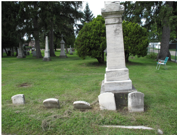
Ryan lost three children